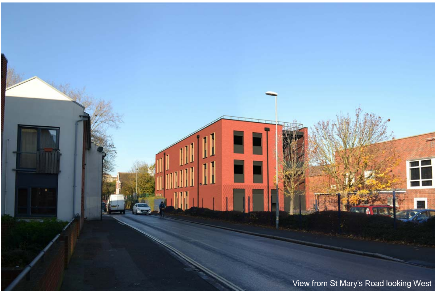
View from St Mary's Road looking West