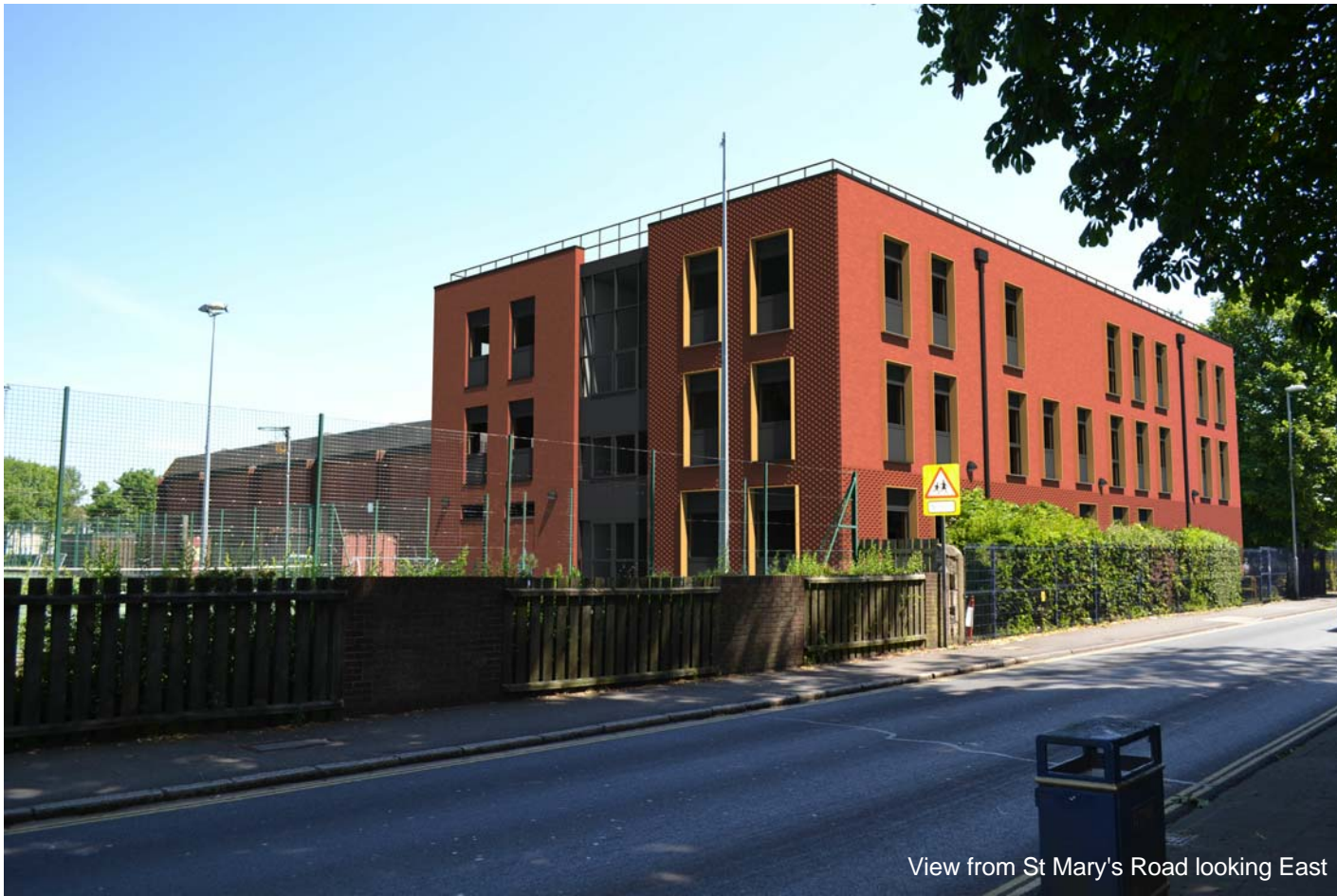
View from St Mary's Road looking East

NOTE: All dimensions to be checked on site prior to commencement of any work ***DO NOT SCALE FROM THIS DRAWING*** Notify C.A of any discrepancies before ordering materials.