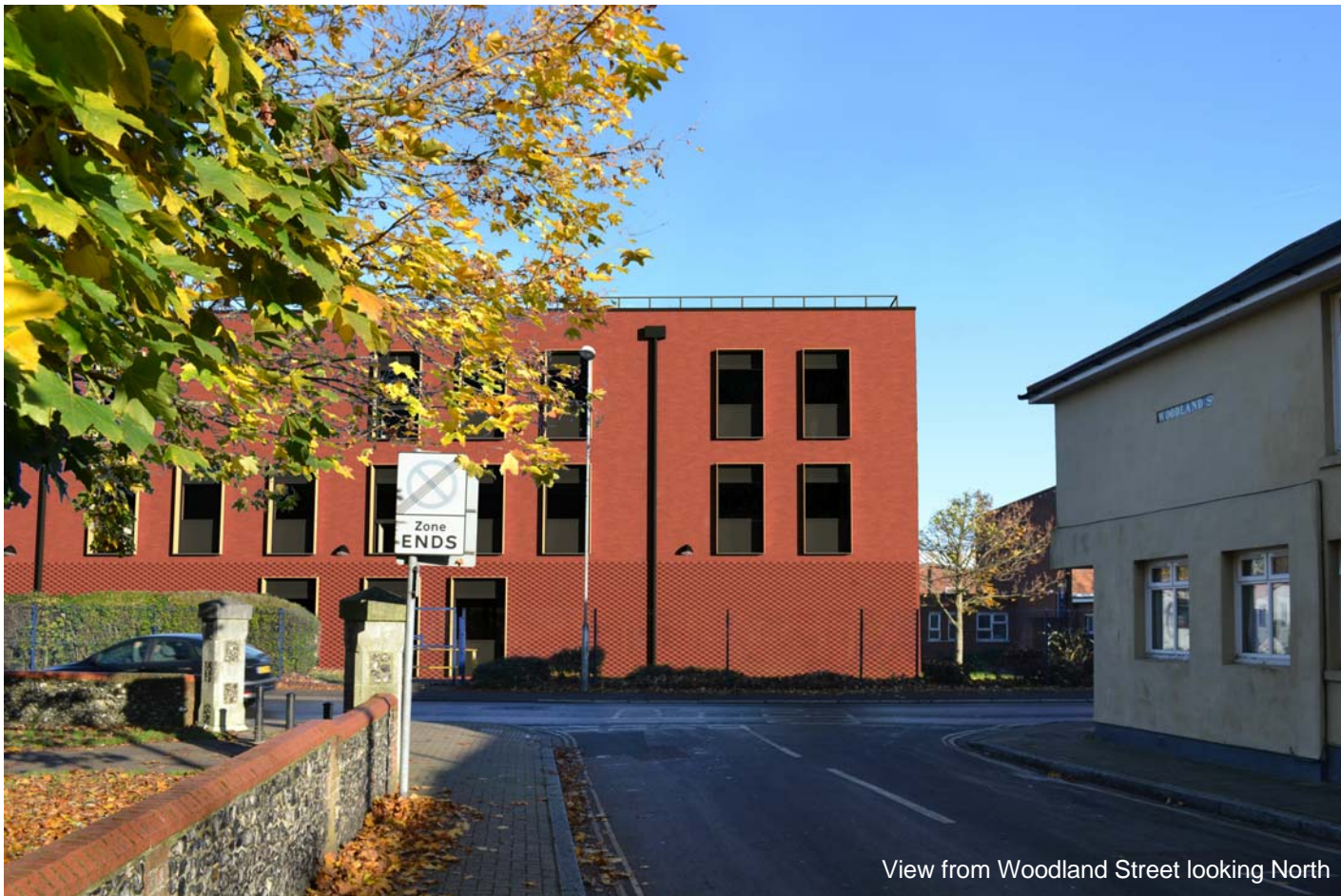
View from Woodland Street looking North